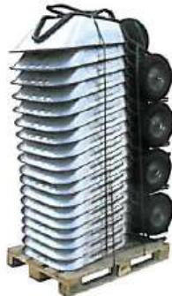
CLIPSO® 90 MP P SOLID WHEEL (4079P) Product Code 308201801 EAN Code 3155030803330