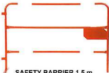
SAFETY BARRIER 1,5 m Product code 35000105 EAN code 3155035000017