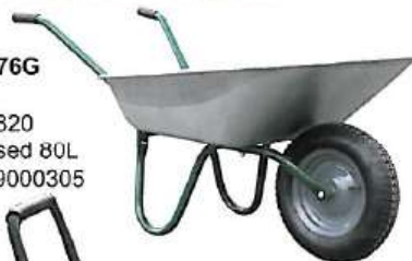
KIT WHEELBARROW 4076G PNEUMATIC WHEEL Product code 930000820 Tray Galvanised 80L EAN Code 5013779000305