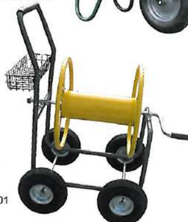
3500 - 4 WHEELS HOSE-REEL PNEUMATIC WHEEL Product code 344350101 EAN Code 3155034435001