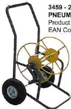
3459 - 2 WHEELS HOSE-REEL PNEUMATIC WHEEL Product code 340346101 EAN Code 3155034034594