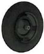
Chillington Solid wheel Product code 930900130