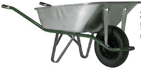
4058G LARGE CAPACITY 150L GALVANISED TRAY WHEELBARROW PNEUMATIC WHEEL

Product code 730001400 Tray Galvanised - 150L EAN Code 3155030090099