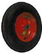
Chillington Pneumatic Wheel Product code 930900120