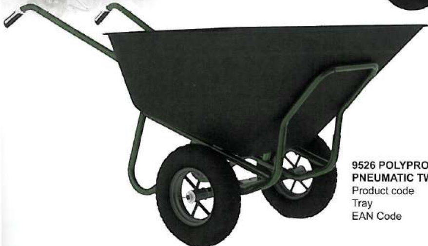
9526 POLYPROPYLENE 300L PAN PNEUMATIC TWIN WHEELED

Product code 930000675 Tray Black Polypropylene - 300L EAN Code 5013779001586