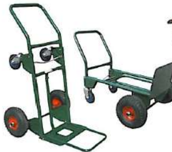
SACK TRUCKS ROLLAX 950 G X 6 PNEUMATIC WHEELS Product code 307071101 EAN code 3155030702183