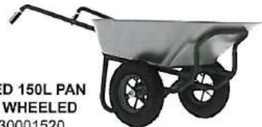
4092G GALVANISED 150L PAN PNEUMATIC TWIN WHEELED

Product code 730001500 Tray Green painted 150L EAN Code 3155030161072