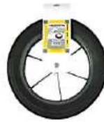
Haemmerlin Solid wheel Product code 309031201 EAN code 3155030903122