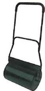
GARDEN ROLLER 3726 Product code 343373612 EAN code 3155034337268