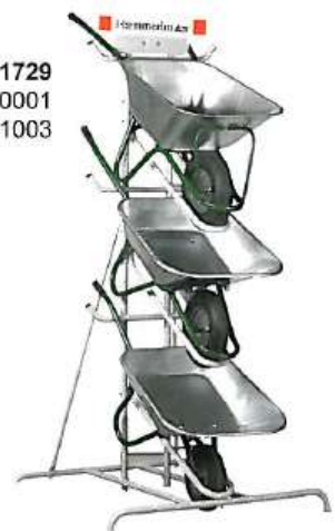
3-TIER DISPLAY Product code 309000001 EAN code 3155030900008

HAEMMERLIN LTD Bescot Crescent Bescot Walsall West Midlands - WS1 4NX Tel (01922) 621286 Fax (01922) 621321