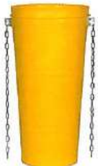
RUBBISH CHUTE Product code 318101001 EAN code 3155031810108