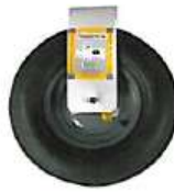
Haemmerlin Pneumatic wheel Product code 309016701 EAN code 3155030901678