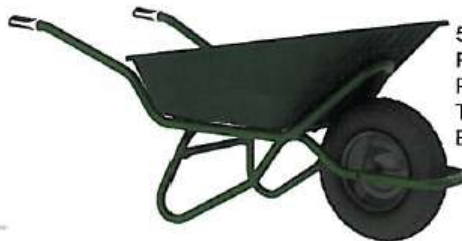
5000 CLIPSO® 90 PPV GF PNEUMATIC WHEEL Product code 308201001 Tray Polypropylene 90L EAN Code 3155030820108

Available part-assembled on pallets. Easy to assemble without the need for nuts and bolts. All round tubular support for added strength and rigidity.