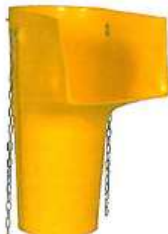
HOPPER Product code 318102001 EAN code 3155031810207