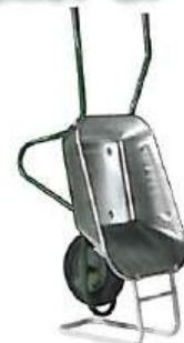
SINGLE DISPLAY Product code 309002901 EAN code 3155030900299