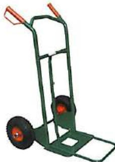
SACK TRUCKS ROLLAX 946 G X 10 PNEUMATIC WHEELS Product code 307070101 EAN code 3155030704187