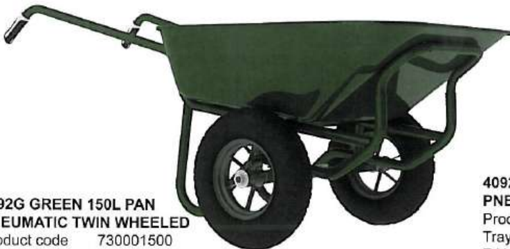
1092G GREEN 150L PAN PNEUMATIC TWIN WHEELED

Product code 730001500 Tray Green painted 150L EAN Code 3155030161072