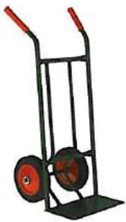
SACK TRUCKS 924 SOLID WHEEL Product code 730002400 EAN code 5013779000299