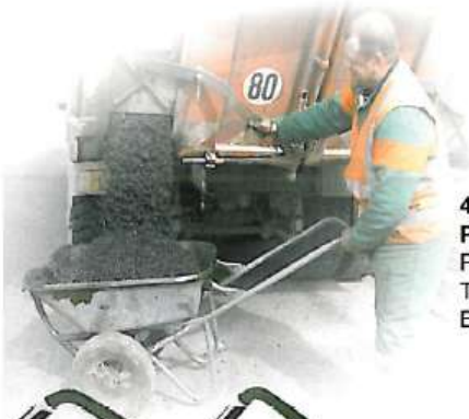
4095G GALVANISED 230L PAN PNEUMATIC TWIN WHEELED

Product code 730001520 Tray Galvanised 150L EAN Code 3155030622573