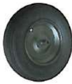
Haemmerlin Puncture proof wheel Product code 309014801