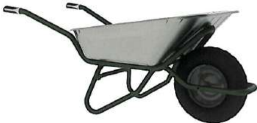
CLIPSO® 90 MG GF PNEUMATIC WHEEL (4079 G) Product code 308201701 Tray Galvanised 90L EAN Code 3155030802036