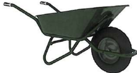
CLIPSO® 90 MP GF PNEUMATIC WHEEL (1079 G) Product code 308201201 Tray Painted green 90L EAN Code 3155030801114